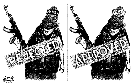
THIS MESSAGE IS BROUGHT TO YOU BY THE WEST, USING YOUR TAX POLLARS TO SUPPORT ONLY THE FINEST JEW-HATING TERRORISTS

The terrorist on the left has a badge on his forehead that says "Hamas" the one on the right says "Fatah."