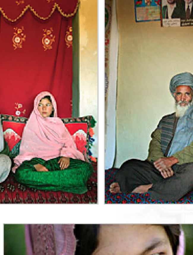
Look at the abuse: