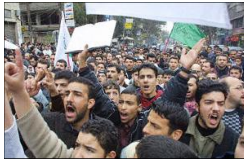
Deism versus Islam

[ Article archive 1 ] [ Article archive 2 ] [ Article archive 3 ] [ Article archive 4 ] [ Article archive 5 ] [ Homepage ] [ Guestbook ]