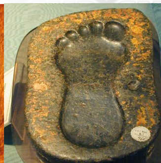
Muhammad had fleshy and swelled hands and feet. His footprint shows he had acromegaly .

and usually kills the patient in his early 60s. It causes impotence, while it increases libido. This explains Muhammad's sexual vagaries in his old age and why in the later years of his life he had such an insatiable craving for sex. He would visit all his 9 wives in one night to touch and fondle them, without being satisfied. His impotence explains his insecurity, paranoia, and intense jealousy of his young wives. He ordered them to cover themselves, lest other men would cast a lustful eye on them. Today, half a billion Muslim women veil themselves, because Muhammad was impotent. Muhammad's illnesses explain a lot of mysteries of Islam.